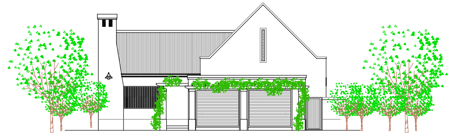
Cape Vernacular Style Elevation