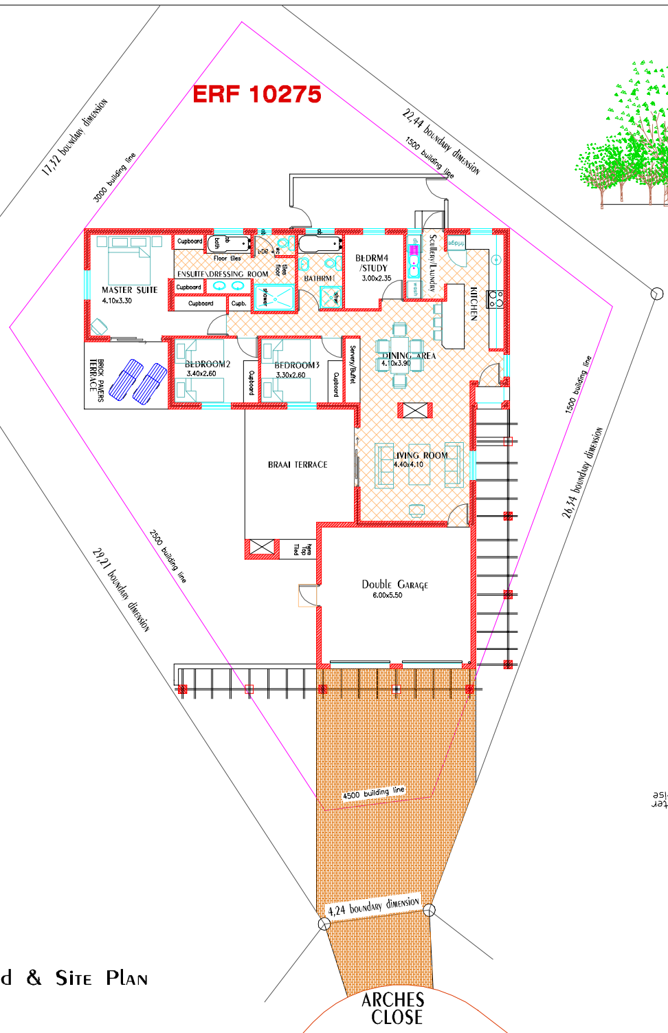
GROUND & SITE PLAN