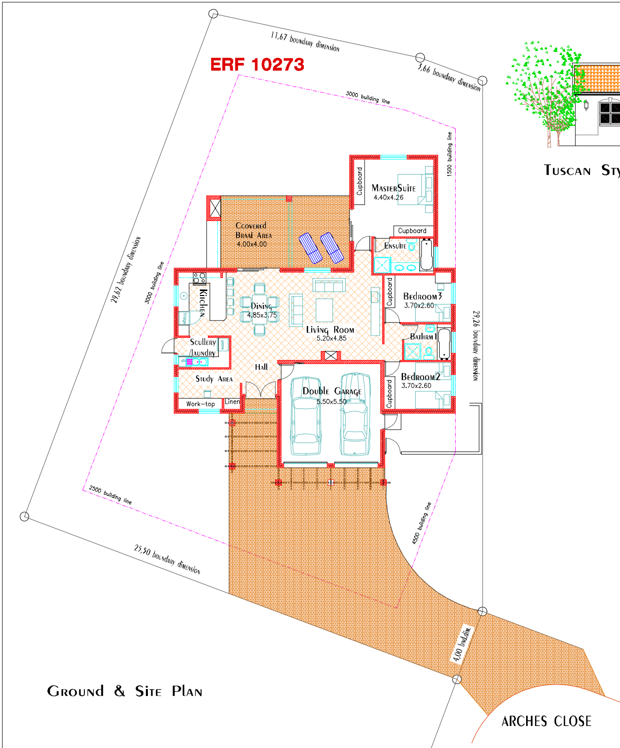
GROUND & SITE PLAN