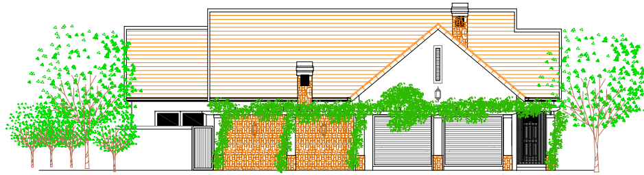
English Country Style Elevation