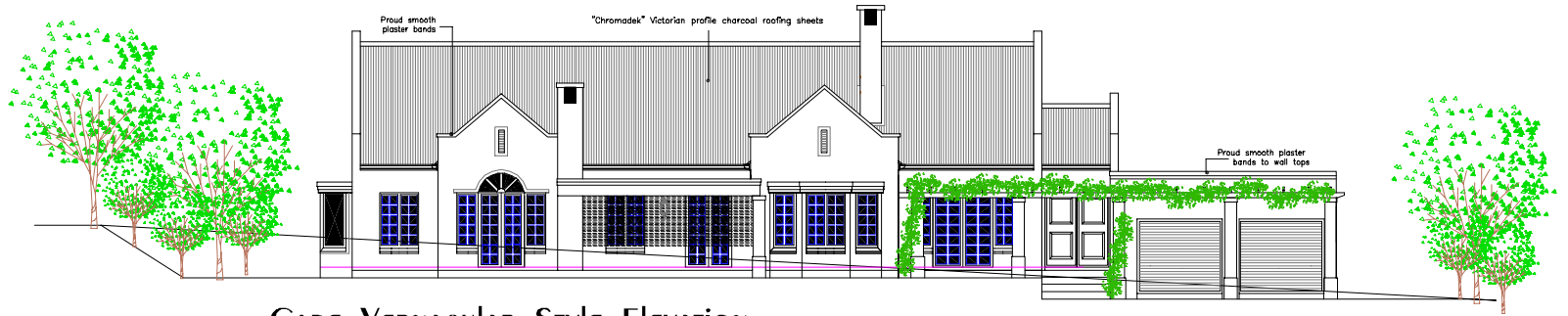
CAPE VERNACULAR Style Elevation