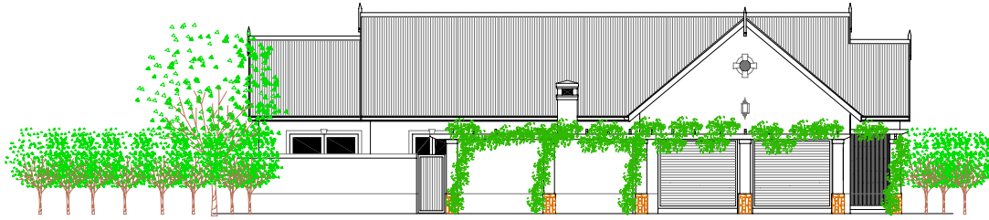
VICTORIAN Style Elevation